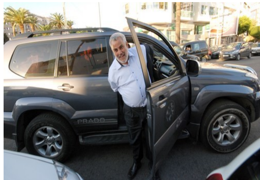
Abdel Benkiran, 1 st Minister